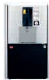
mc-mp Pay system and milk cooler