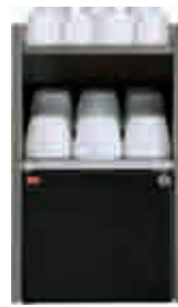
mc-cw Cup warmer and milk cooler