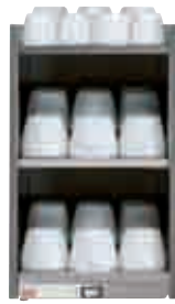
cw Cup warmer