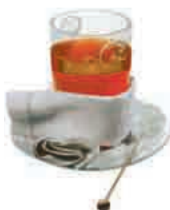
Hot water for tea